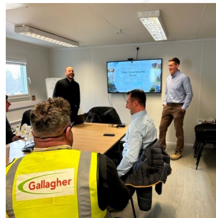
Galliford Try delivering the SCF Safer Groundworks Event at the North West Hospital site in Chertsey, Surrey